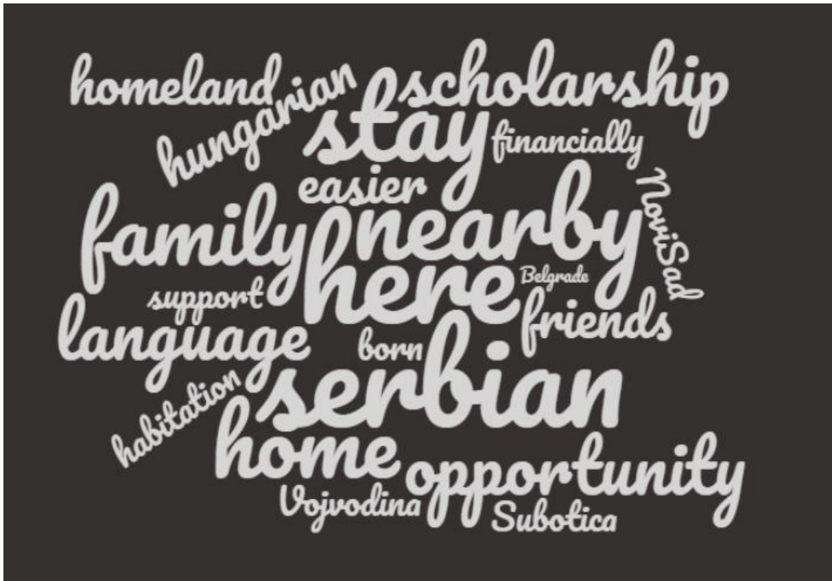
Figure 3 Word cloud depicting the most common arguments for studying in Serbia (n = 86)