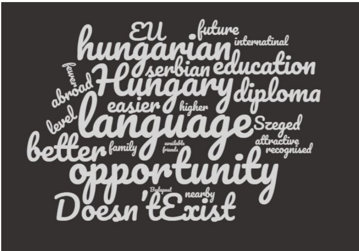
Figure 4 Word cloud depicting the most common arguments for not studying in Serbia (n = 247)