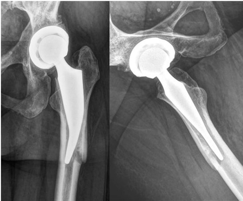
Fig. 3. a: Radiograph taken 6 months postoperatively, showing a consolidated fracture on the AP view without subsidence if compared with postoperative image (Fig. 2b). b: Lateral view 6 months postoperatively showing a well positioned stem.

Most publications, which describe results following total hip replacement using short stems mention the odd case of a conservatively treated periprosthetic femoral fracture. Details or radiographs are rarely provided. Non-operative treatment is possible, but only after a detailed analysis of the fracture pattern, and implant position. A CT scan might provide useful if conservative treatment is considered. Patient compliance is of paramount importance.