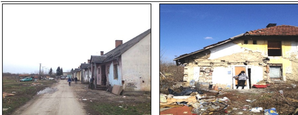
Fig. 2 – Housing conditions in smaller segregates (left) and larger segregates (right)

patroned (underclass Roma) families concerning different issues in different ways, including recreation, educational and health issues, job search, etc. The initiative has built previously non-existent connections (bridges) between the local middleclass and underclass families. Such an initiative and related relationships between families of different social groups serve as extremely good objects of observation in the case the aim is to observe the interpersonal connections and connections between individuals and institutions (involved individuals/families often cooperate concerning the issues which involve cooperation with the social institutions, e.g. school issues, labor issues, housing issues, etc.). Thus, this initiative – and the broader PAR process – provides opportunities for observations concerning both bonding, linking and bridging social capital.