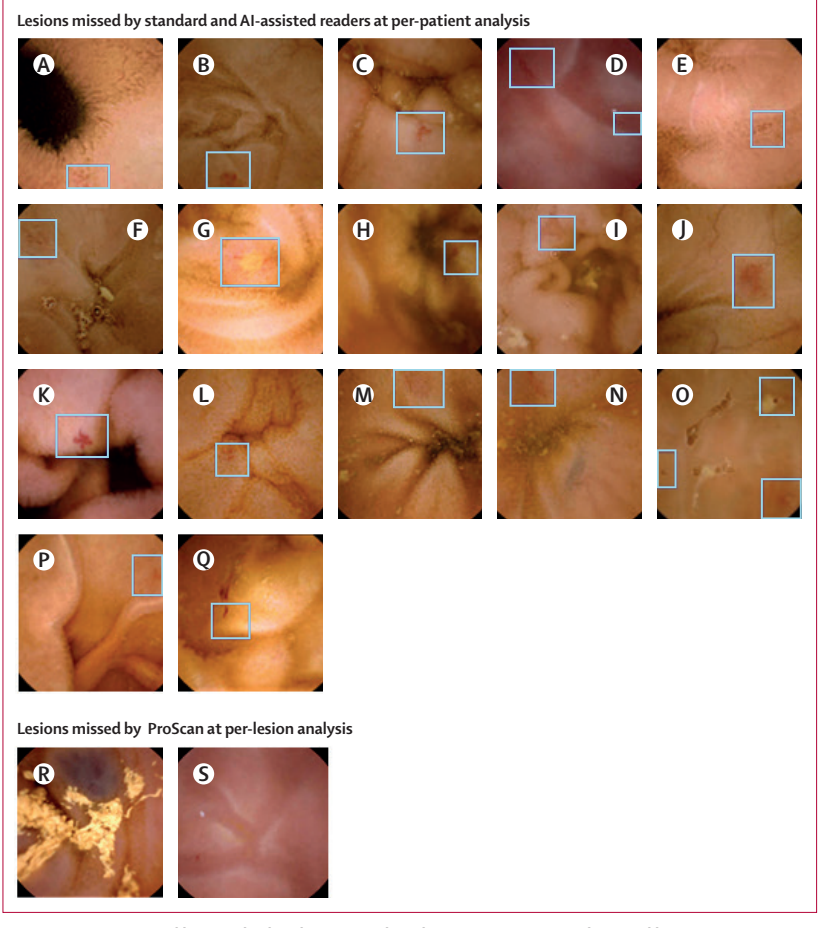
Figure 3: Lesions missed by standard and AI-assisted readers at per-patient analysis and by ProScan at perlesion analysis

Table 2: Diagnostic performance metrics of AI-assisted and standard reading (with board reading as the gold standard)