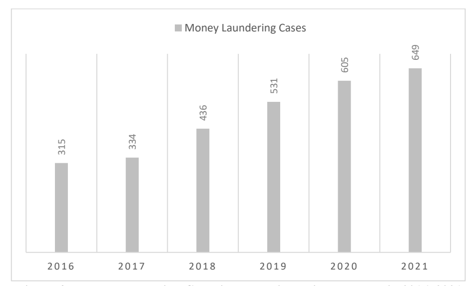
Figure 4. Money Laundering Cases in the EU including Portugal in 2016–2021 (Source: FATF, 2022, as cited by EUROJUST, 2022)