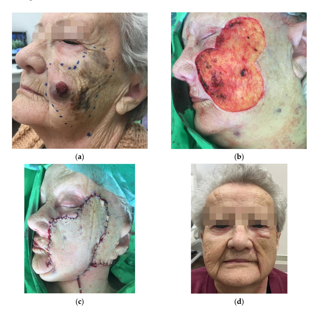
Figure 3. (a) Locally advanced LMM and NMM of the cheek preoperatively. (b): Defect after primary tumor excision; (c) immediate postoperative picture; (d): six-month follow-up.

In Patients 2 and 3, large cervicofacial flaps were transposed to the defect with extensive undermining on the neck and secured to the zygomatic bone by periosteal anchoring (see Figure 3).