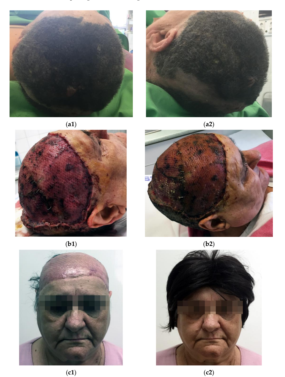
Figure 4. (a) Giant melanoma of the scalp preoperatively; (b) two-week follow-up, healed mesh skin graft; (c): six-month follow-up.

In Patient 1, after the removal of the giant melanoma from the scalp, the 627 \text{ cm}^2 defect was covered with a split-thickness skin graft harvested from the left thigh. The skin graft healed well with complete graft take (see Figure 4).