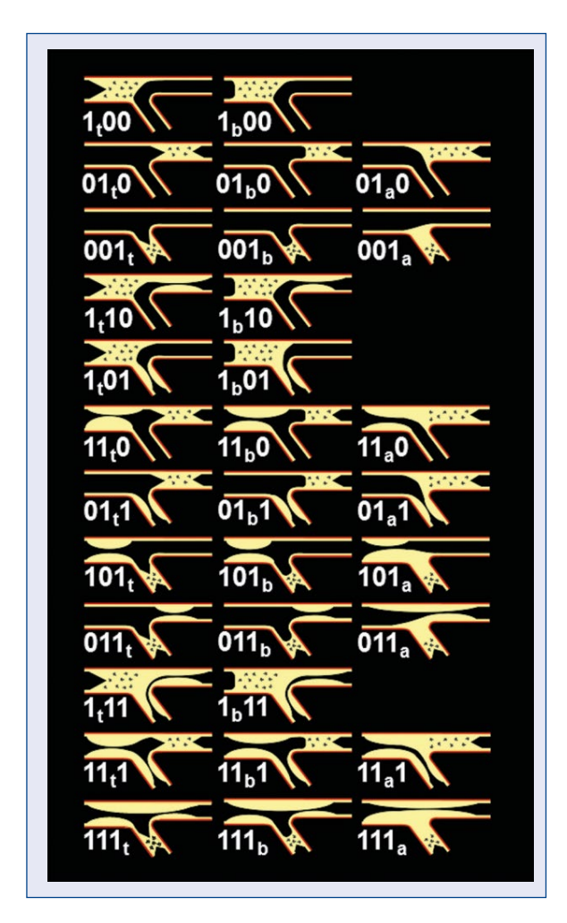
Figure 1. Medina-chronic total occlusion classification, basic categories, monosegmentary lesions (only 1 segment of the bifurcation occluded).

To minimize the number of basic categories, some pragmatic and empiric rules were defined: