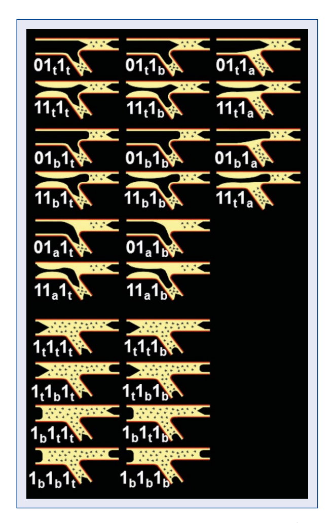
Figure 2. Medina-chronic total occlusion classification, basic categories, bisegmentary (2 segments of the bifurcation occluded), and trisegmentary lesions (all 3 segments of the bifurcation occluded).

Following these rules, the total number of basic categories of the classification is 56, distributed as 32 monosegmentary lesions, 16 bisegmentary lesions, and 8 trisegmentary lesions (Figs. 1, 2). Some examples of CTO-CBL classified according to Medina-CTO are presented in Figure 3.