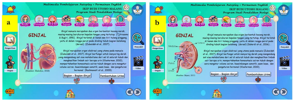
Figure 3(a) Media material before and Figure 3(b) Media material after including valid or clear sources

(Munawaroh, 2017) and is related to students' motor activities when jumping over boxes drawn on the ground or floor (A. B. U. Putri & Hasyim, 2017). The display of the media after being given input by the validator and corrected can be seen in Figure 2(b) where the basic competency points 4.10 have been included. Subsequent inputs and improvements will be seen in Figures 3(a) and 3(b) below.