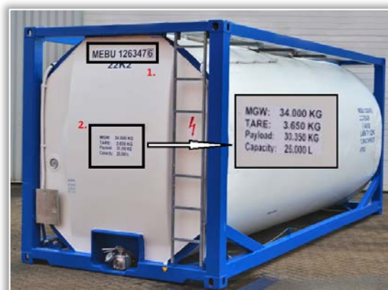
Figure 1: Tank container [2]

(on figure 1)) for identification, but it is also known: