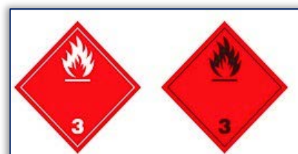
Figure 5: Flammable liquid labels [7]

The ADR gives contexts for alcohol in the case of a mobile tank. (TP1), where TP1 specifies that the degree of filling can be determined as described in clause 4.2.1.9.2. [4]