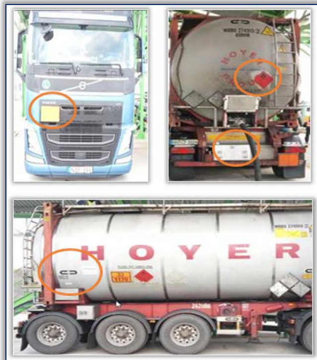
Figure 3: Sign and label [6]

It is very important to comply with the ADR rules for anhydrous alcohol during the transport. When transporting ethanol, care must be taken to observe the appropriate markings. As alcohols and their solutions are to be classified as Dangerous Goods, the instructions given in the ADR must be followed for consignments. [4] [9] The UN number [5] of the transported medium and the hazards of the transported material must be indicated in clearly defined places on the trailer and on the towing vehicle. The figure below shows where the labels and the UN number plate should be placed. The figure below shows that a sign must be placed on 2 sides and a label on all 4 sides. [6]