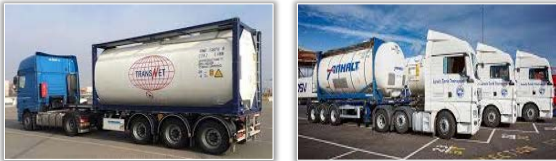
Figure 2: Different-axle-number vehicles [3]

In the case of a three-axle vehicle, the maximum mass is 44 000 kg (Figure 2 right), however, if we do not have such a tractor, even in the case of a two-axle vehicle, 42,000 kg is permitted on public roads (Figure 2 left) until the consignment reaches the railway or boat station.