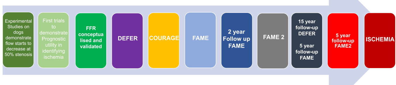
Fig. 2. Landmark trials of myocardial ISCHEMIA and revascularization in CCS over the years

Jandmark trials of myocardial ISCHEMIA and revascularization in CCS over the years 1970s 1980s 1996 201 2007 2009 2012 2015