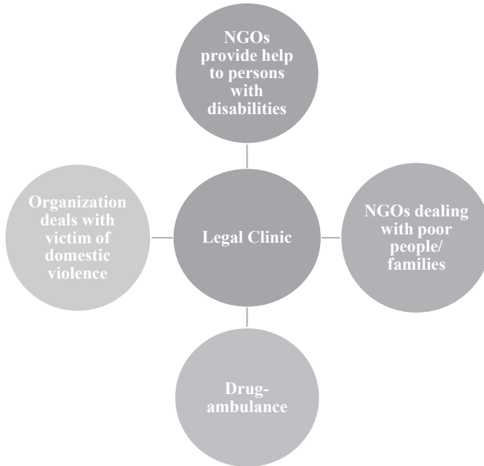
Figure 3. Interrelations between the LC and its partners

or project planning, while in exam and summer periods, it is the tutors who have to manage urgent claims. Figure 3 demonstrates the interrelations between the LC and its partners.