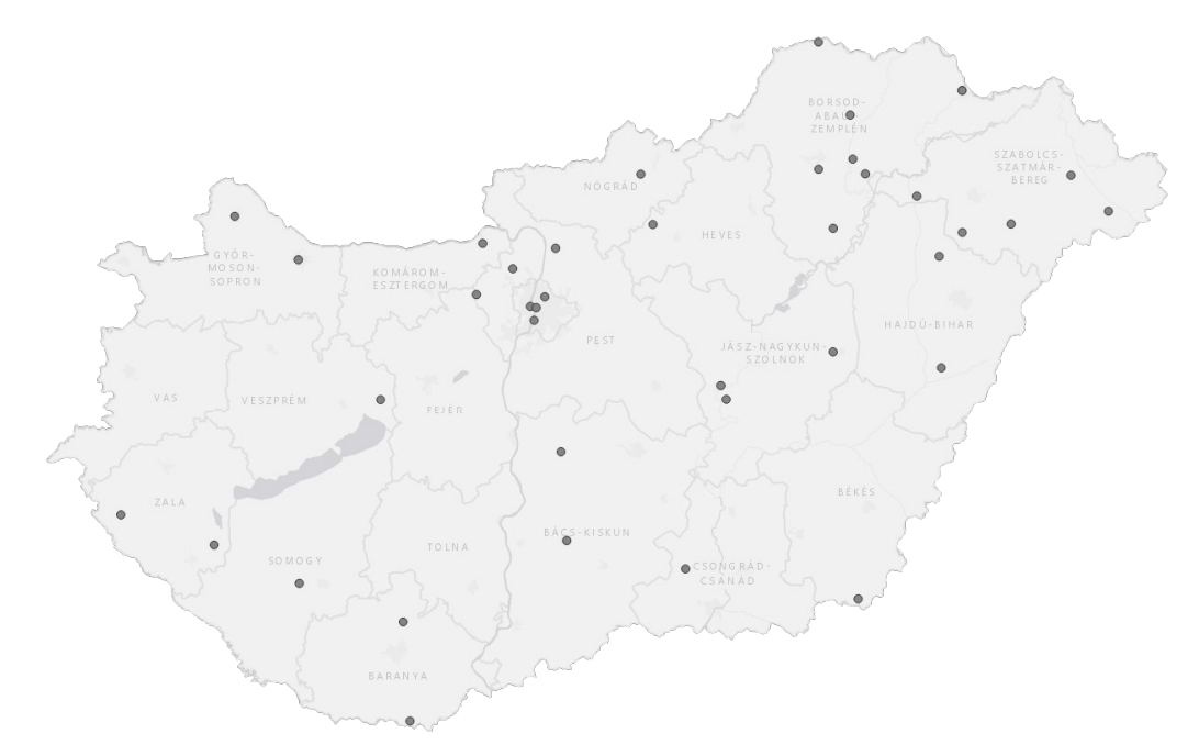
Figure 1: The geographical distribution of the responding ASPs

Thirty-one of the responding ASPs are maintained by independent civil society organisations, seven by church-affiliated and two by school-affiliated ones, while six of them are maintained by a church and a further two by other entities. As regards duration of operation, the responding ASPs can be seen as heterogeneous (mean=7.1 year; SD=4.9; min.= 1; max.=27).