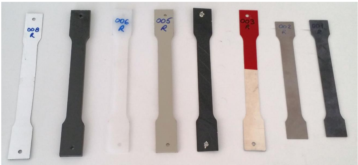
Figure 1. Materials selected to measure resonant frequencies.

The first step to achieving our goal was to acquire the materials that are commonly used in aircraft construction, to set a baseline we also acquired some materials that are not used in aircraft construction but are readily available and their properties widely documented. We made contacts with the trading companies in Csongrád county where we could procure the structure materials S235, S275, S355 in different thickness. For purchasing technical plastics the Kár-Plaszt 2000 Kft. based in Szeged helped us with plastics produced by them, so we could manufacture the standard test specimens. The aluminium alloys applied in aircraft industry were cut out at the airport of Szeged from the wing structure of a used fixed-wing aircraft (therefore we had got authentic values for the mechanical features), from which the tensile specimens were made (Fig. 1).