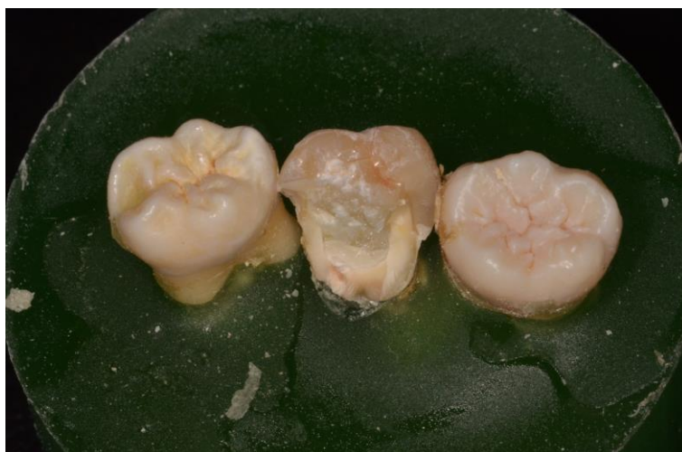
Figure 3. Fracture pattern deemed unrestorable as it extends under the CEJ.

Furthermore, apart from determination of the load required for fracture, evaluation of the fracture type is important from a clinical point of view. Thus, whenever conducting a load-to-fracture test, not only the fracture resistance, but also the failure mode should be evaluated. After the mechanical testing, the fractured specimens are examined regarding their fracture patterns. According to Scotti and co-workers, distinction is made between restorable or nonrestorable fractures under optical microscope with a two-examiner agreement. Based upon their evaluation system, a restorable fracture is above the CEJ, meaning that in case of fracture the tooth can be restored, while a nonrestorable fracture extends below the CEJ and the tooth is likely to be extracted [14] (Figure 3).