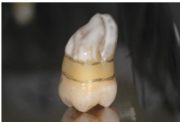
Figure 1. A layer of latex separator applied on the root surface before embedding.

Usually the first and most important step when testing tooth-restoration units is measuring fracture resistance. This can be performed in a static load-to-fracture setup with a universal testing machine. As stated by Ref. [5] static loading is usually the first step in the evaluation process of a novel dental materials and related techniques and is commonly used in order to obtain basic knowledge regarding the fracture behaviour and load capacity of a restored tooth. There are a number of factors that may interfere with resistance to fracture, such as the differences between specimens, tooth embedment method, type and direction of load application, crosshead speed, and simulation of thermal or mechanical fatiguing [6]. During this test intraoral conditions should be mimicked as much as possible. During the embedding of the samples two important elements should be emphasized: simulating the periodontal ligaments and simulating the bone level around the roots. In order the best mimic the elastic property of the periodontal ligaments, which normally connects the roots to the bone in a healthy clinical situation, the root part of the samples is covered with a layer of liquid latex separating material prior to embedding [7] (Figure 1.).