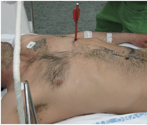
Figure 2 Left side thoracoabdominal injury. From a thoracotomy and transdiaphragmatic approach, the heart, diaphragm, and stomach injuries were managed. The patient was survived.

for thoracotomy was haemodynamic instability caused by injury to the heart or great vessels (9).