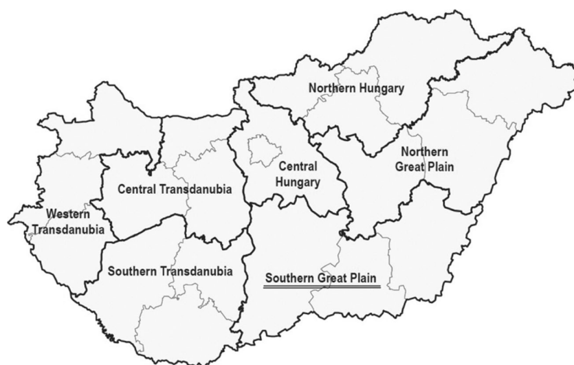
Fig. 1 Introduction of the area of our regional centre in Hungary that caters for the population of three counties in south-eastern Hungary (Southern Great Plain)

C-KIT mutation examinations are made on every bone marrow biopsy sample evaluated at our centre. Only those cases are considered to involve SM which comply strictly with the WHO 2008 criteria (1 major+1 minor or at least 3 minor criteria together). In Hungary, serum tryptase level measurement is currently still not available, but (even without the determined tryptase levels) all of our presented cases meet the WHO criteria of 2008.