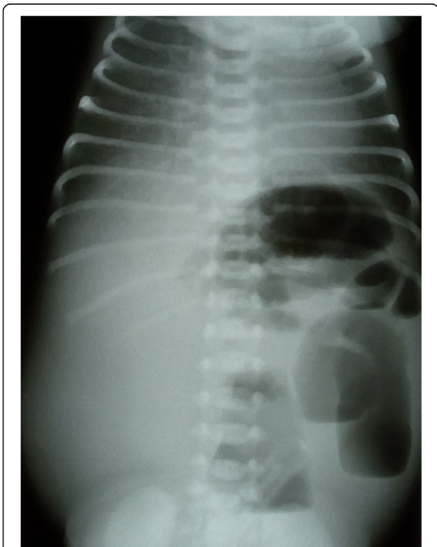
Fig. 1 Simple abdominal radiography. Imaging study on the first life day shows small bowel ileus

The premature boy, born by Cesarean section at 32 weeks of gestation, had a birthweight of 1850 g and Apgar scores of 6/1 and 9/5. Prenatal ultrasound was performed at 24 weeks of gestation and showed small bowel dilatation of the fetus and increased flow in the ascending aorta. The newborn had abdominal distension and had thin, fluid-like discharge from the rectum. Abdominal radiographs showed small bowel ileus (Fig. 1). On postnatal day 2, laparotomy was performed revealing a type 1 malrotation of the gut associated with obstructing Ladd's Bands. On postnatal day 12, the newborn developed symptoms of late-onset sepsis caused by Klebsiella pneumoniae . Gastrointestinal bleeding, pulmonary hemorrhage and a small intracranial hemorrhage were also present. The patient had bilious emesis and failure to pass stool. Imaging studies showed dilated loops of the bowel; therefore, detorquation of a bowel loop and adhesiolysis were performed. After reoperation, he tolerated feeding and gained weight; however, repeated blood analyses indicated hyponatremia, hypochloremia, hypokalemia and metabolic alkalosis, necessitating prolonged oral electrolyte replacement therapy. Sweat test showed normal chloride concentrations and direct sequencing of the coding regions of the cystic fibrosis transmembrane conductance regulator ( CFTR ) gene revealed a single