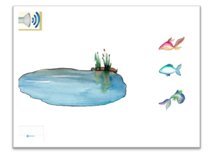
Figure 1. A sample item from the mouse usage test

The inductive reasoning test comprised two subtests: figural series and figural analogies (see Figure 2). In case of figural series, students are required to drag the right answer into the yellow box from the shapes below the line that matches the sequence of shapes above the line. In case figural analogy, students are required to find out the missing shape which fits into the yellow box regarding the result of changes in the other two boxes.